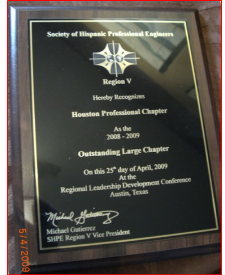
SHPE Houston wins Region 5 Outstanding Large Chapter Award