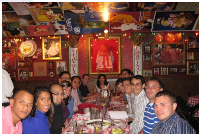
End of Year Dinner and board election results at Bucca di Peppo!

Society of Hispanic Professional Engineers PO Box 271704 Houston, TX 77277 SHPE@SHPEHouston.org www.shpehouston.org